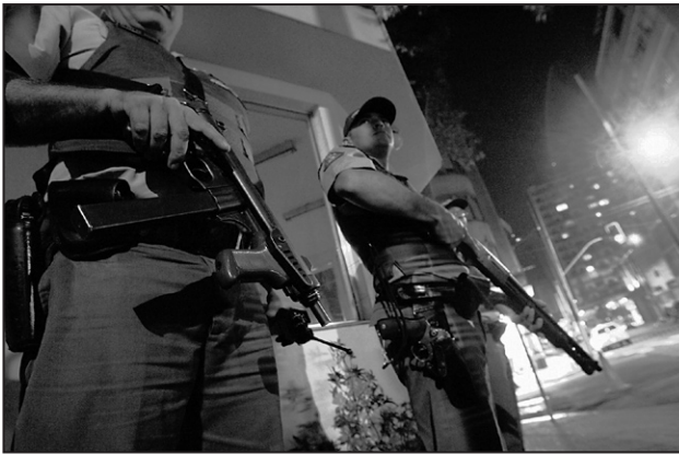
Police on alert in central Sao Paulo after several attacks by the criminal organization PCC.

Brazilian Justice Minister Marcio Thomas Bastos committed approximately 4,000 military police to the Força Nacional de Segurança Pública (Public Security National Force), a federal military police strike force trained to handle public security threats. 9 He also offered the support of Brazilian Army units if needed. But São Paulo Governor Claudio Lembo, filling in for presidential candidate Geraldo Alckimin (the former state of São Paulo Governor) refused to accept federal help. 10 A few days later Minister Bastos traveled to São Paulo to again offer federal assistance, "but ... it was refused." 11