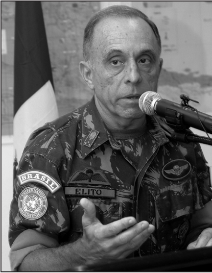
2 February 2006 , Brazilian Army General Jose Elito Carvalho de Siqueira, then commander of the United Nations Stabilization Mission in Haiti (MINUSTAH), during a press conference in Port-au-Prince.

developed by the Eastern Military Command in Rio de Janeiro in 1994, is an example of those successful deployments. Public poll results clearly demonstrate that more than 75 percent of populations in the largest Brazilian cities want the deployment of the Armed Forces to resolve public security problems. 66