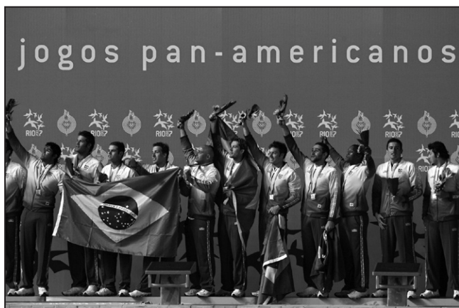
26 July 2007, the Brazilian silver-medalist water polo team greets the crowd at the Rio 2007 XV Pan American Games.

The results of the Pan American Games were very good. The Fédération