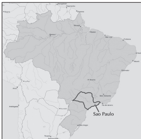
Brazil, showing the state of São Paulo (dark outline) and the location of São Paulo city.

Since 2000, violent crime had dropped throughout the state of São Paulo. The law enforcement that helped produce this drop in crime also resulted in alarmingly overcrowded state prisons. These prisons then became breeding grounds for the development of criminal organizations.